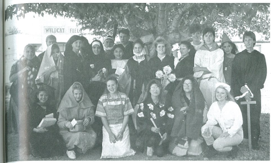
Acting out the Canterbury Tales, these seniors take a break from their pilgrimage to pose for a picture.